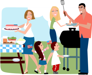
Come and enjoy the company, the clowns, food, and games