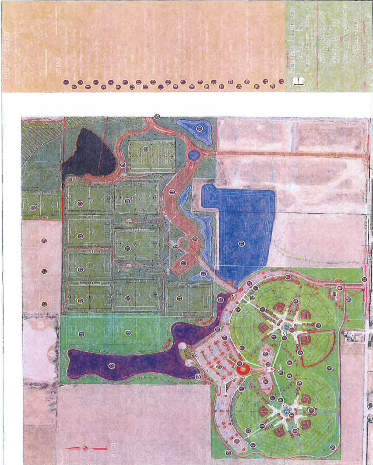
EXHIBIT "B" TO USE AND DEVELOPMENT COMMITMENT